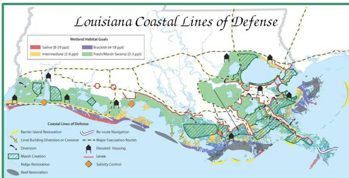
Summary Map of Multiple Lines of Defense

This report recommends integrated coastal projects and levee alignments for the entire coast of Louisiana with the overriding goal of improving hurricane flood protection and sustaining the coastal estuaries.